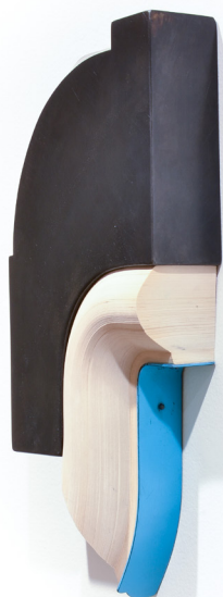
Collection, 2020 Steel and book paper 16 x 7 x 2.5 inches 3200