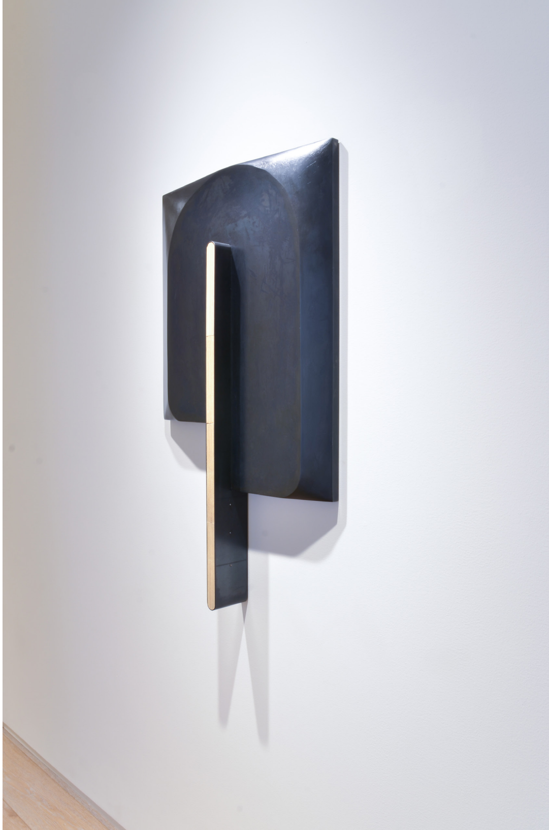
A Point of Relation , 2021 Steel and book paper 41 x 24 x 4 inches 6400