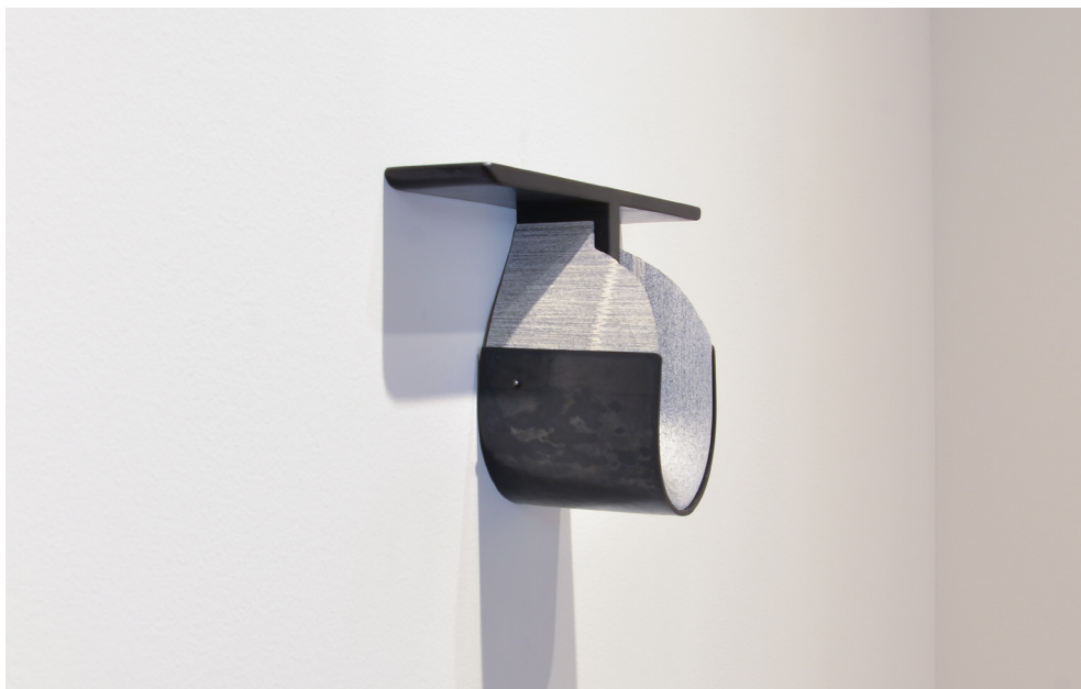
Junction , 2021 Steel and book paper 7 x 11 x 3.75 inches 2600