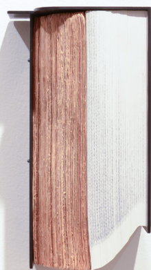
Aver, 2021 Steel and book paper 9 x 5 x 4 inches 3200