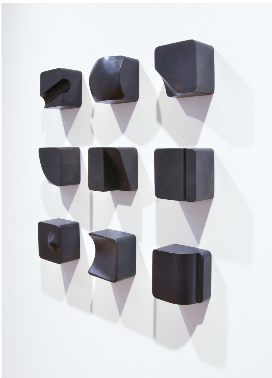
Plane Study 4 x 4 , 2021 Steel 20 x 20 x 2.75 inches (overall as installed) 3800