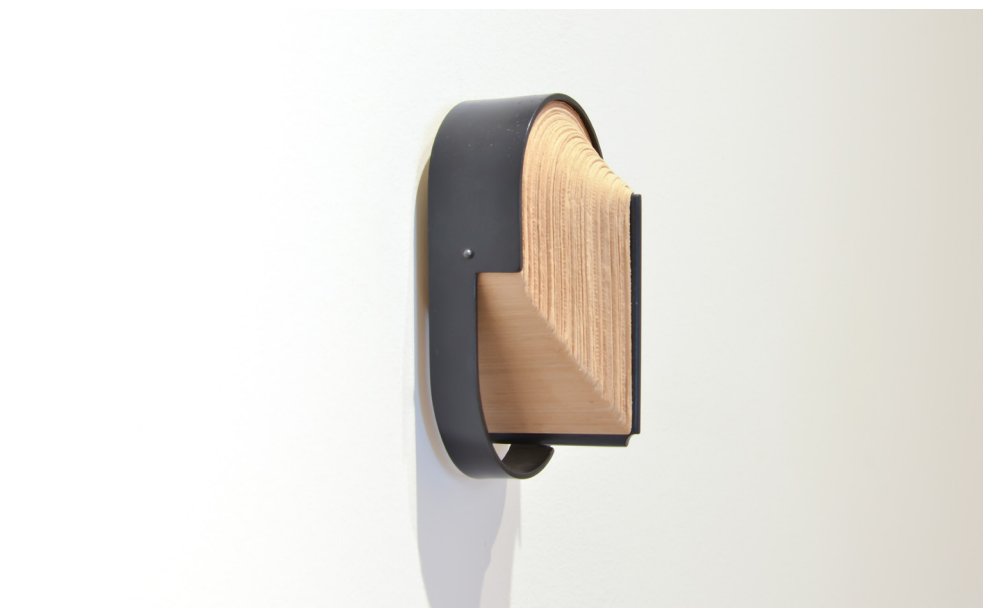
Chevron , 2021 Steel and book paper 6.5 x 4 x 3.25 inches 2400