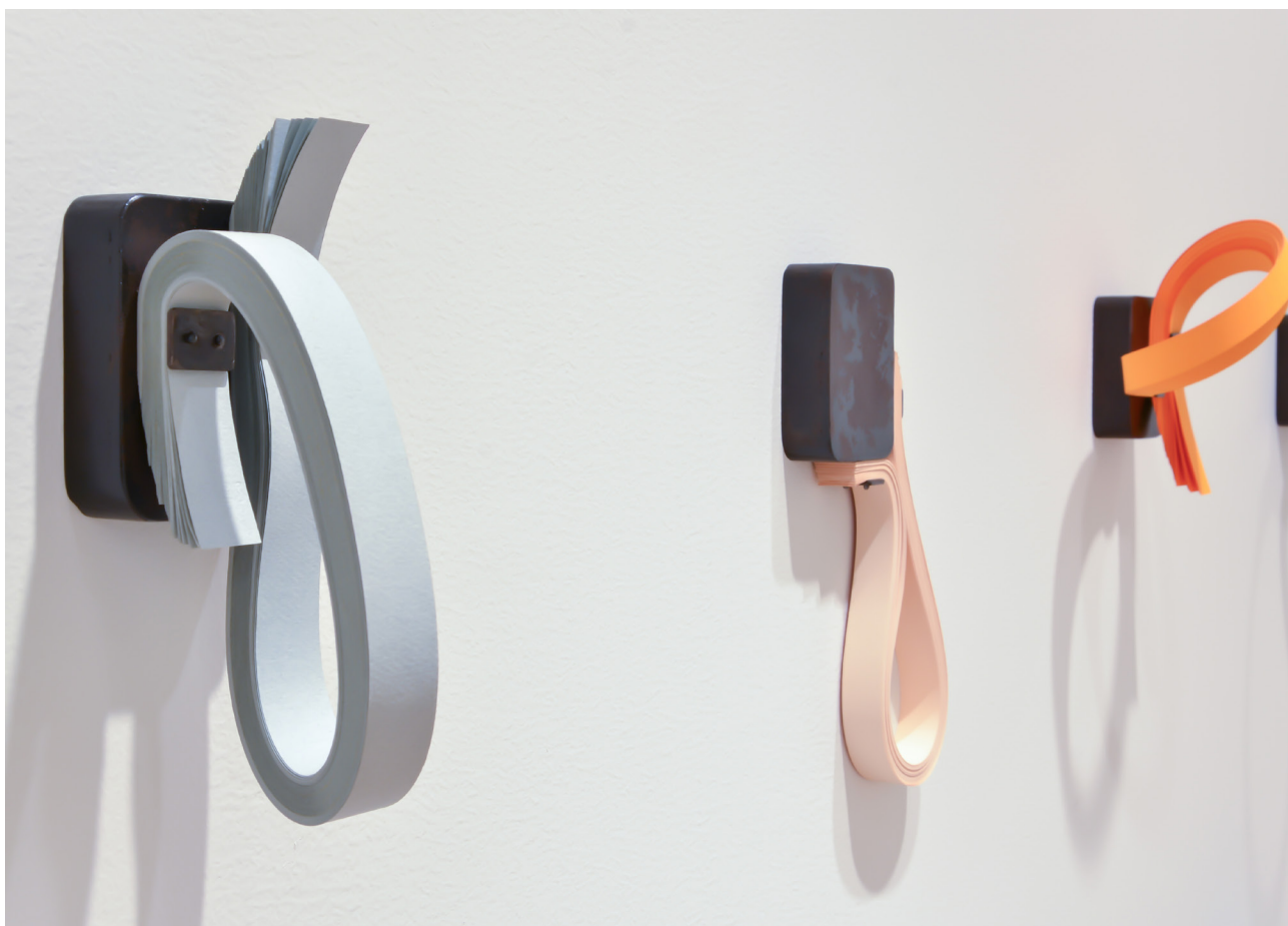
Line Collection , 2018 Steel and paper 15 x 117 x 6 inches (overall as installed) 4800